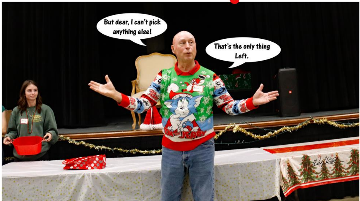
KofC Christmas Party 2025