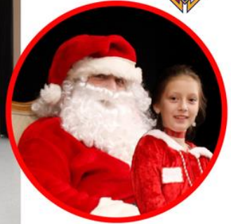
KoC Christmas Party 2025